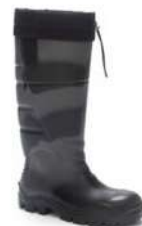
BLACK CAMOUFLAGE BLACK