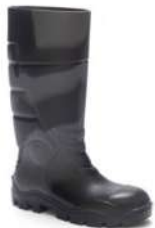
BLACK CAMOUFLAGE BLACK