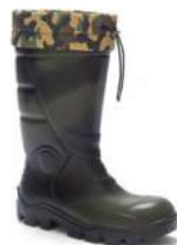
GREEN CAMOUFLAGE BLACK