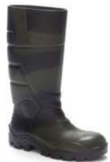
GREEN CAMOUFLAGE BLACK