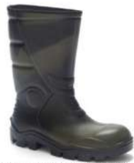
GREEN CAMOUFLAGE BLACK