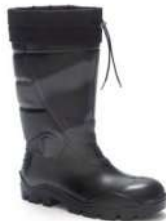
BLACK CAMOUFLGE BLACK