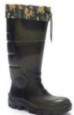
GREEN CAMOUFLAGE BLACK