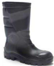
BLACK CAMOUFLAGE BLACK